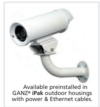
Available preinstalled in GANZ® iPak outdoor housings with power & Ethernet cables.