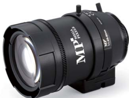
*Photograph is a similar model.